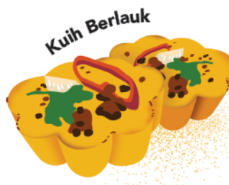
and spring onion/parsley.

Soto ayam or chicken soup, with a choice of rice, noodles or vermicelli. This fragrant spicy soup packs a solid punch. Try it with the black sauce chilli condiment!