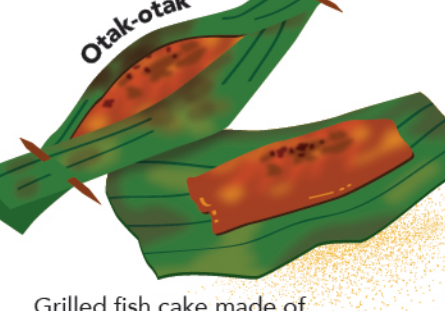
Grilled fish cake made of ground fish meat mixed with tapioca starch and spices.